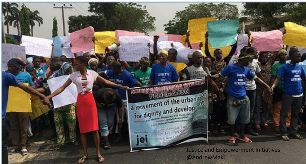
Picture 2. November 15th's Demonstration

resulting evictions and human suffering, and has repeatedly requested dialogue with the Lagos State Governor, and called on the Nigerian Police Force to cease their attacks on Otodo Gbame. Unfortunately, till date the Governor has failed to reply to any requests from the affected residents for dialogue. The Nigerian Slum/Informal Settlement Federation has also provided the evictees with humanitarian aid and where possible, has provided homeless evictees with shelter in other waterfront communities. Meanwhile, JEI is following-up and informing regularly on the case.