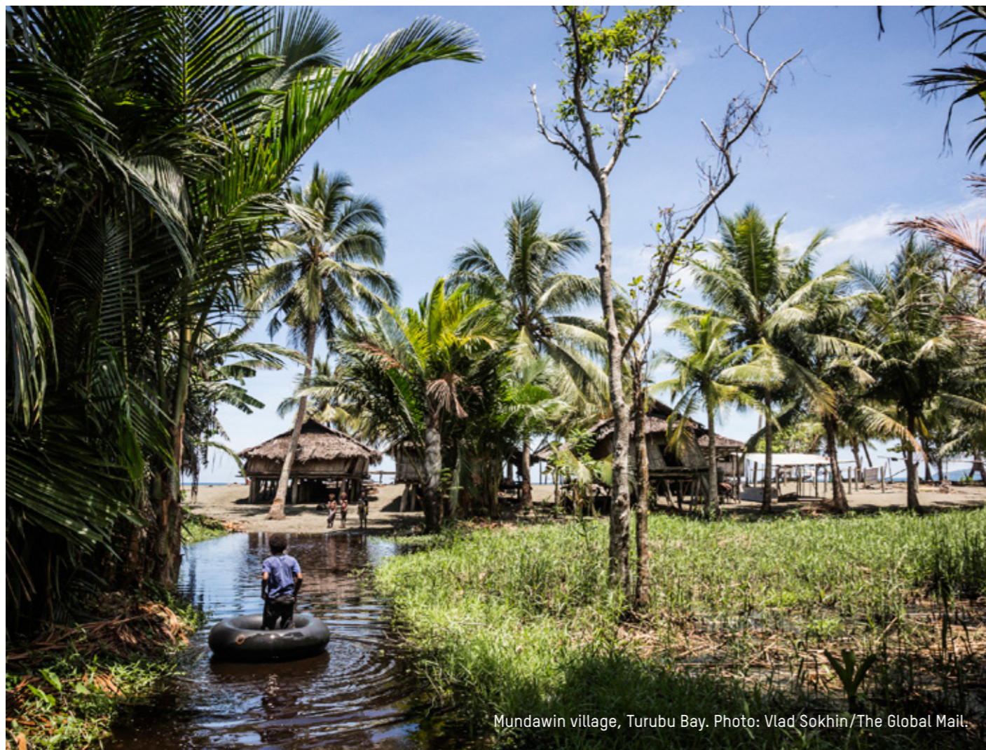
Mundawin village, Turubu Bay.