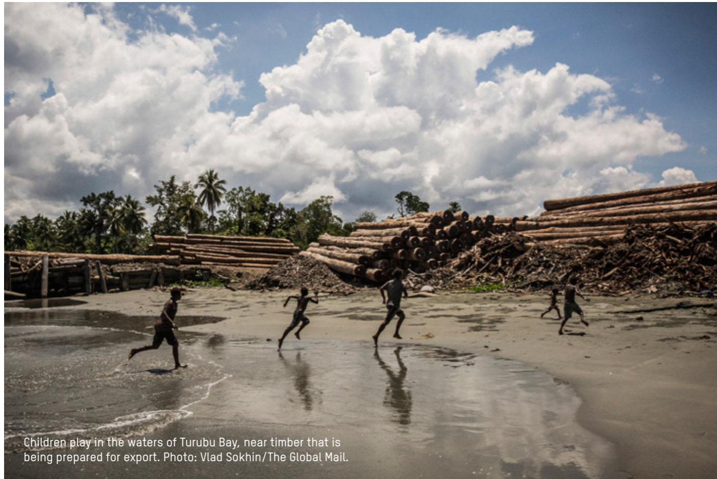
Children play in the waters of Turubu Bay, near timber that is being prepared for export.