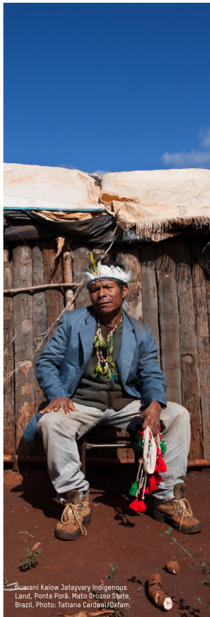
Guarani Kaiow Jatayvary Indigenous Land, Ponta Porã, Mato Grosso State, Brazil.

In the words of a leading Asian agribusiness company, "in the face of imminent global crises such as climate change, environmental degradation, depleting resources, widening rich-poor divide and so on ... sustainable development is the only way forward." 23 Oxfam firmly supports this premise. This report outlines how investors and our big four banks, in particular, need to chart a better pathway towards that future or risk creating scores of homeless and hungry people in their wake.