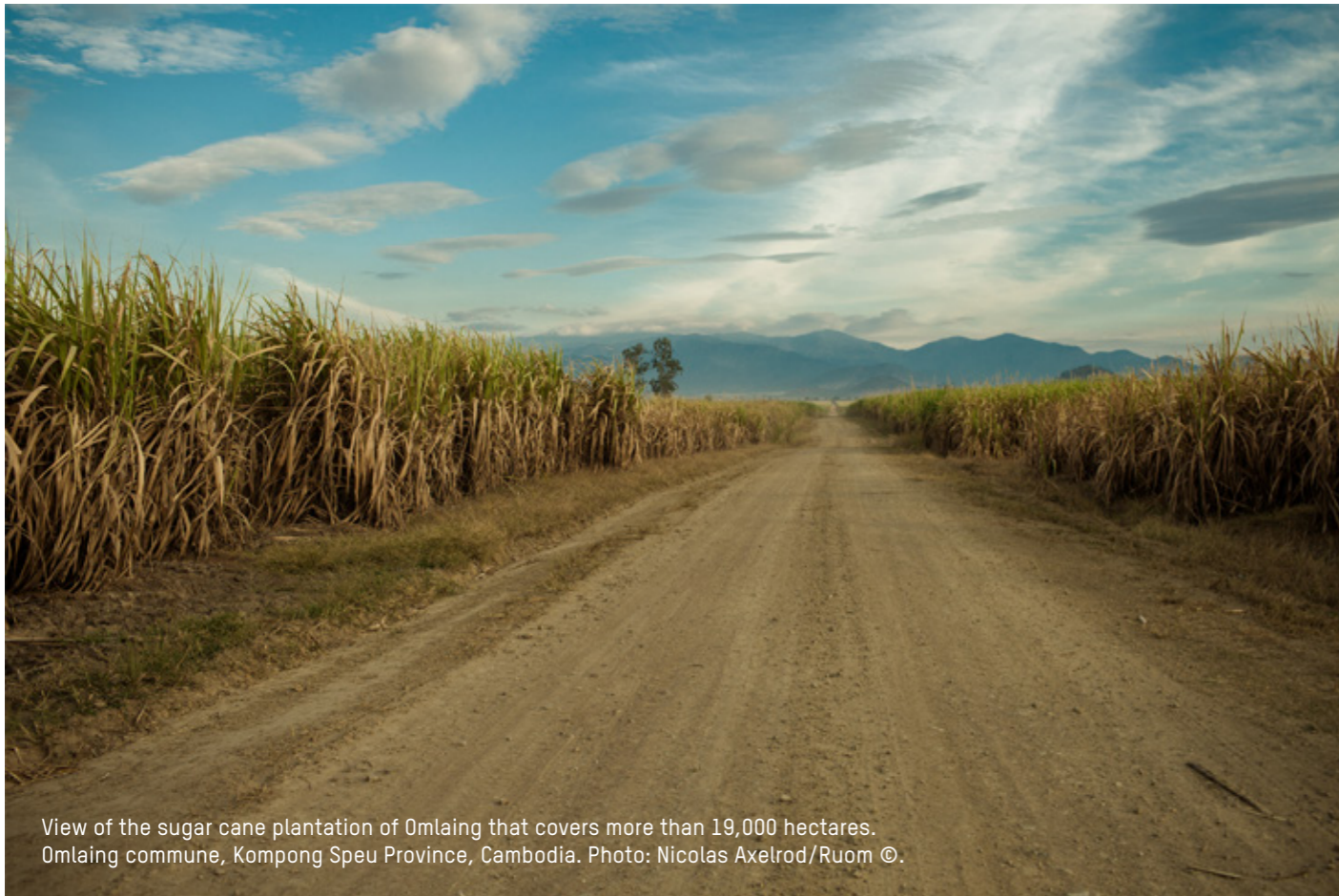
View of the sugar cane plantation of Omlaing that covers more than 19,000 hectares. Omlaing commune, Kompong Speu Province, Cambodia.

and employment for affected families. However, it appears that the audit team failed to visit the majority of resettlement sites and talked to only a handful of villagers before making its conclusion.