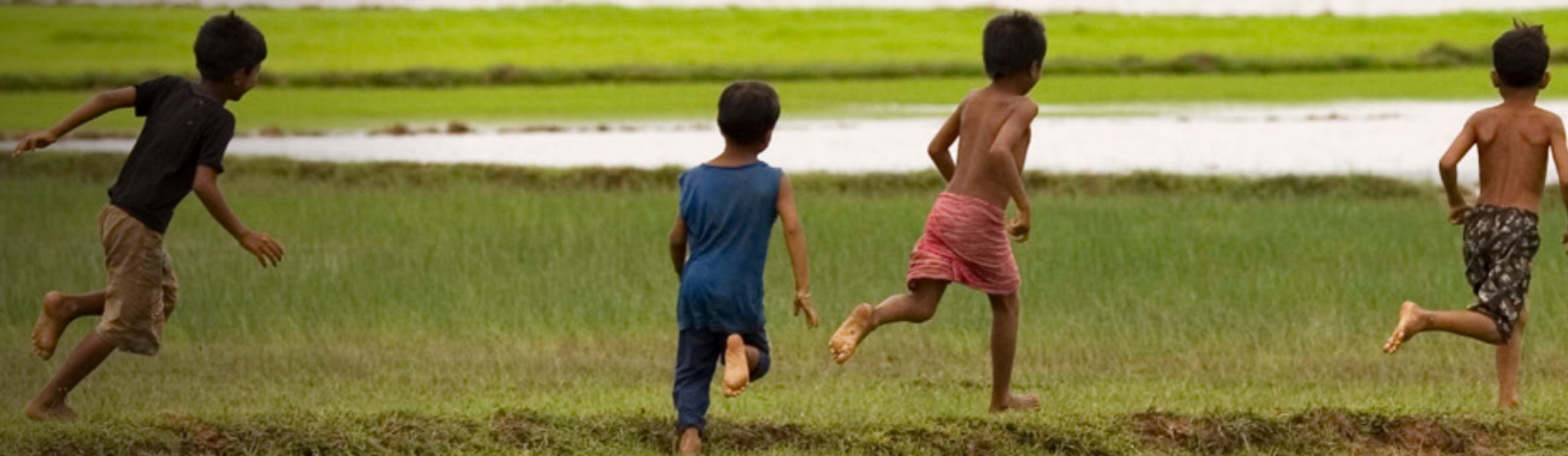
Children run to play in the rice paddy, central Cambodia.

“WE LOOK TO ... STAY ONE STEP AHEAD OF THE ISSUES WE BELIEVE WILL AFFECT THE SUSTAINABILITY OF COMMUNITIES AND, THEREFORE, OUR OPERATIONS.” Westpac 195