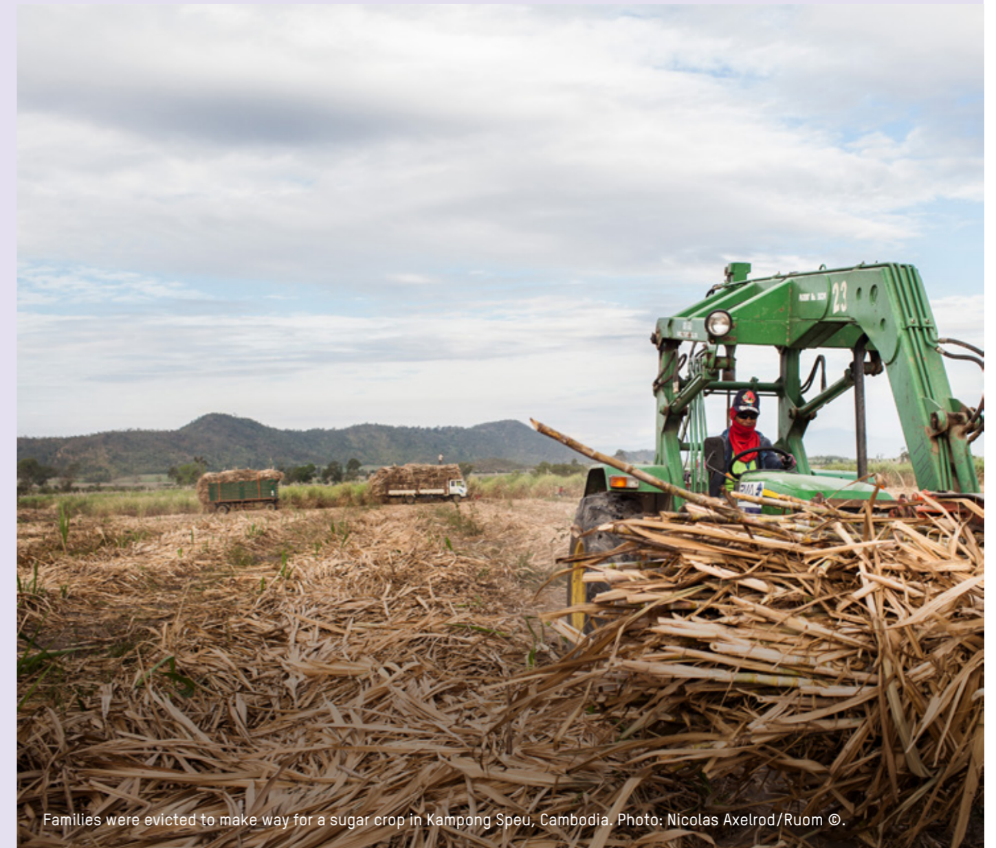
Families were evicted to make way for a sugar crop in Kampong Speu, Cambodia.

“ANZ’S LICENSE TO OPERATE ACTIVITIES INCLUDE COMMITMENTS TO ENSURING THAT ANZ’S CUSTOMERS, PEOPLE AND SUPPLIERS, AND THE COMMUNITIES AND ENVIRONMENT IN WHICH IT OPERATES, ARE TREATED IN A MANNER BEFITTING A RESPONSIBLE CORPORATE CITIZEN.” ANZ 231